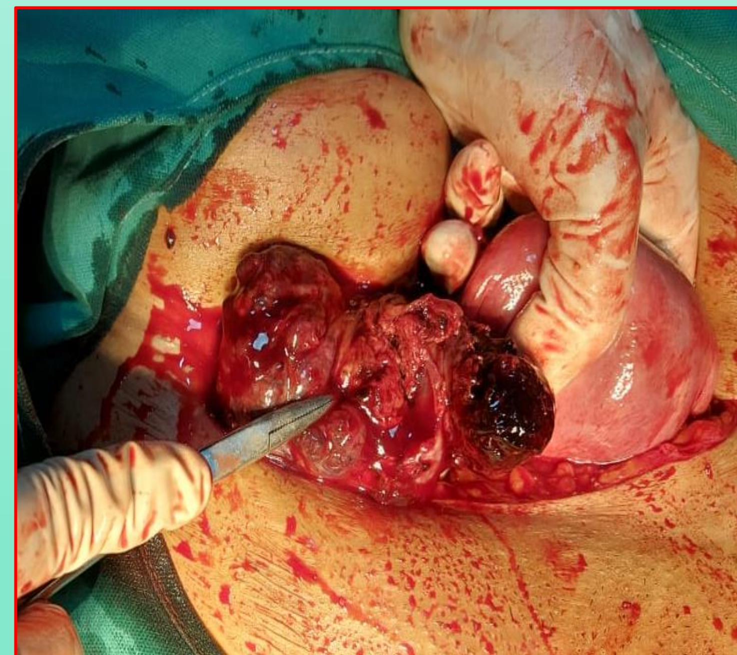
Areas of hemorrhage and necrosis with syncytiotrophoblast

INVESTIGATION : UPT- +ve, LDH- 296 U/L, 28/5/21, B-HCG-70,400 miu/ml , AFP- 1.8 mg/ml, TSH- 1.2 iu/ml.(In view of +ve UPT and the presenting clinical scenario, this case could be easily mistaken for ruptured ectopic pregnancy, but very high values of \beta HCG prompted us to evaluate other tumor markers for germ cell tumor). SCAN REPORT - Ill defined heterogenous lesion in right adnexa measuring 6.2 x 4 x 3.6 cm showing peripheral vascularity. Minimal fluid is seen surrounding lesion. Right ovary not separately visualized. Minimal free fluid in pelvic and peritoneal cavity. MRI- Isodense right adnexal lesion noted 3x3.2cm with surrounding free fluid